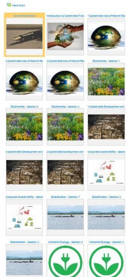
SUSTAINABLE FUTURES COURSE ON THE ECOSTAR WEBSITE