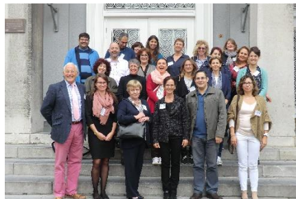
THE PARTICIPATING PARTNERS IN THE 4TH CONSORTIUM MEETING

The EMI course being developed in WP4 , Introduction to “Sustainable Futures”, is also progressing, and the first pilot as a stand-alone course began in the fall semester. It will also be incorporated into the PDP being developed for EMI. Other partners to pilot in the spring semester.